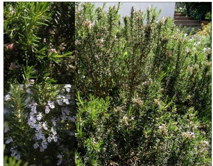
Rosemarinus officinalis Rosemary

Location in the Quinta: South east corner of the old house, near patio.