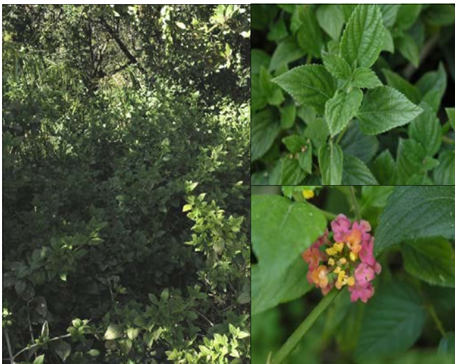
Lantana camara * Common Lantana

Location in the Quinta: North side of main drive at the corner of