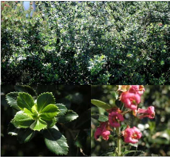
Escallonia macrantha * Escallonia

A large evergreen shrub often planted for hedges, it is both salt and wind tolerant. Appearing as a large, coarse looking shrub, with very shiny evergreen leaves and bright red/pinkish flowers throughout the year. Often used as a hedge since its growth is so thick it makes an impenetrable border.