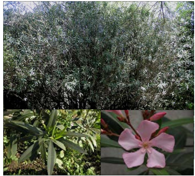
Nerium oleander Oleander

Location in the Quinta: The front of Armin's house.